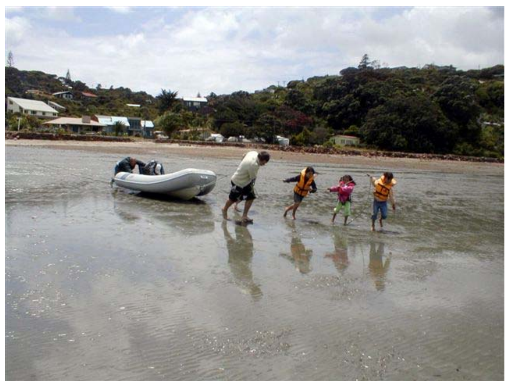
Dingy Pushing: A frequent Roselina sport since the tide can make the ocean move several hundred meters away during a short shopping trip (here on Waiheke Island).