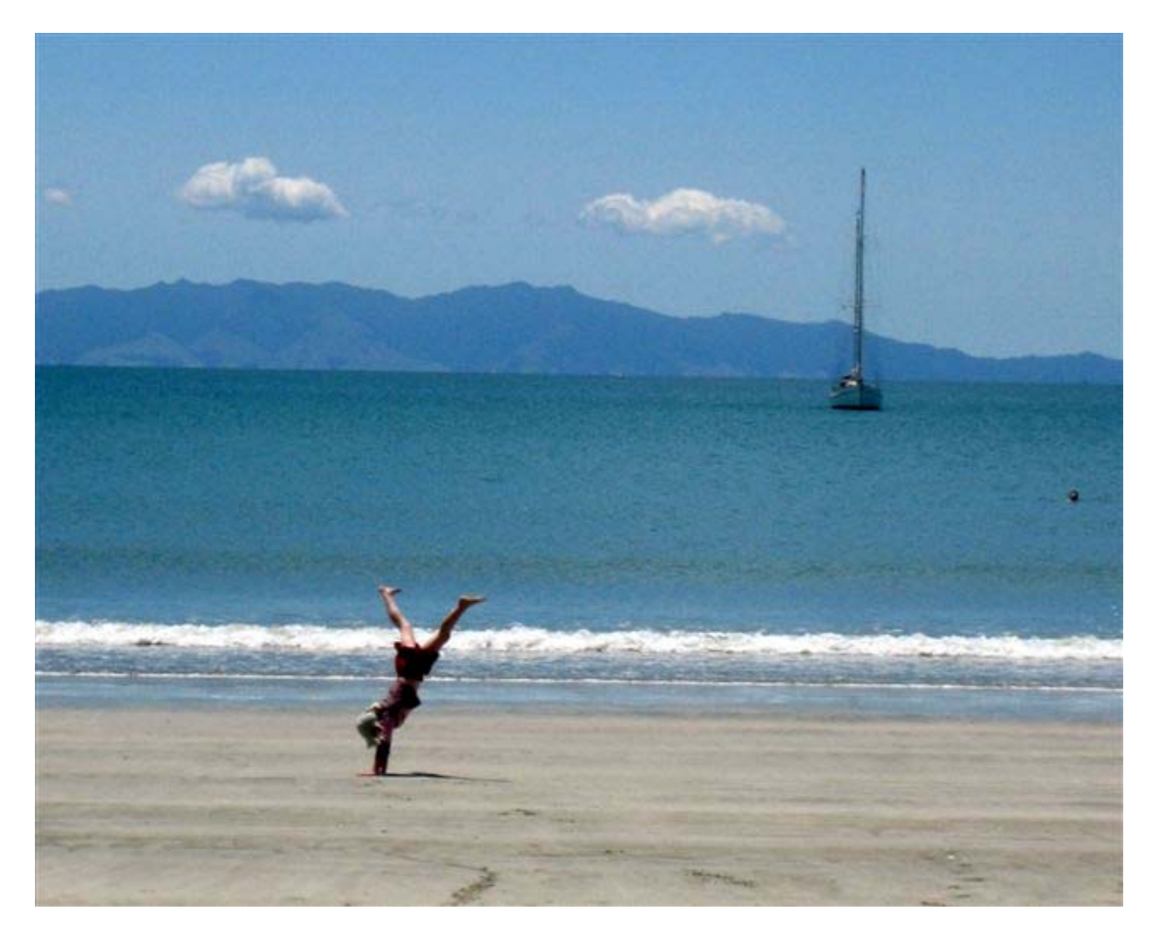
Mathilde on the beach on Waiheke Island, with Roselina in the background.