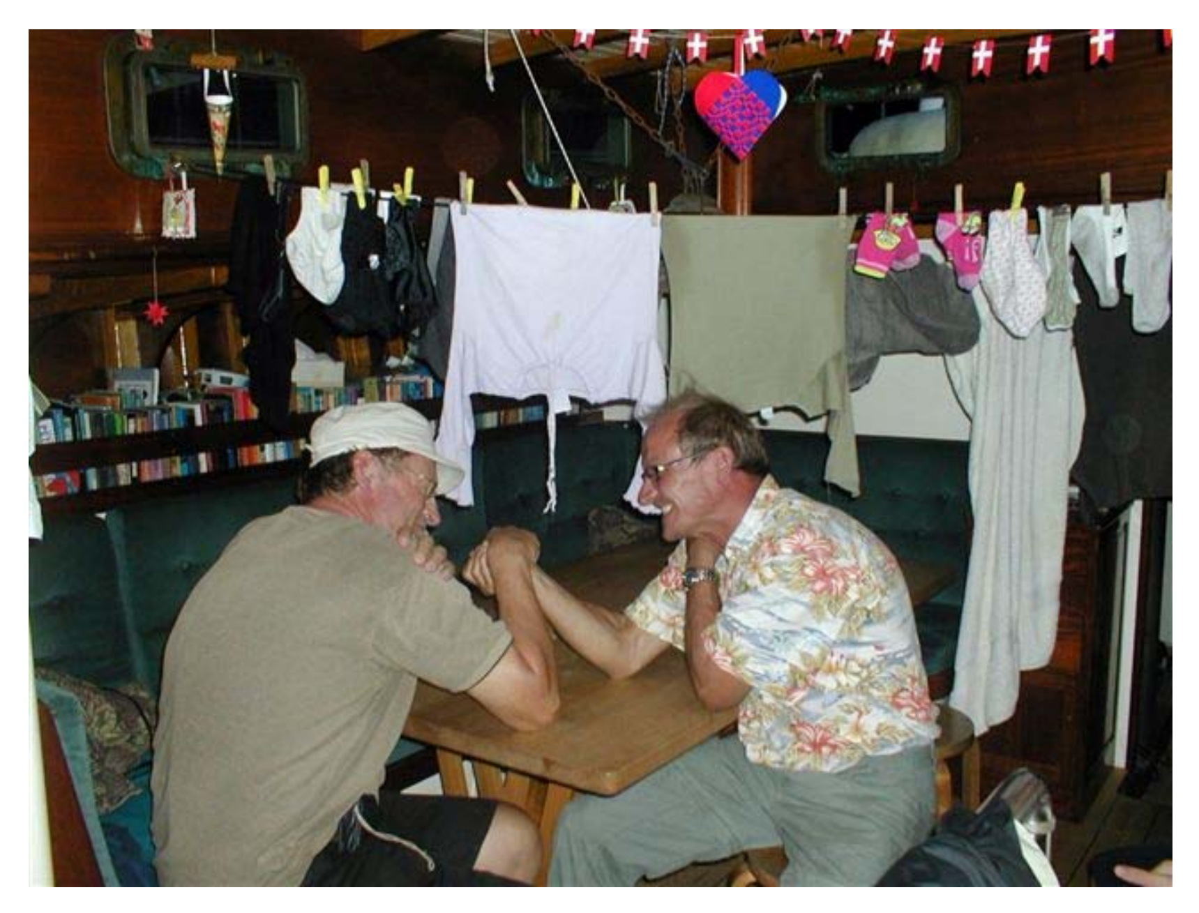
AC is undisputably the strongest person on Roselina at the moment.