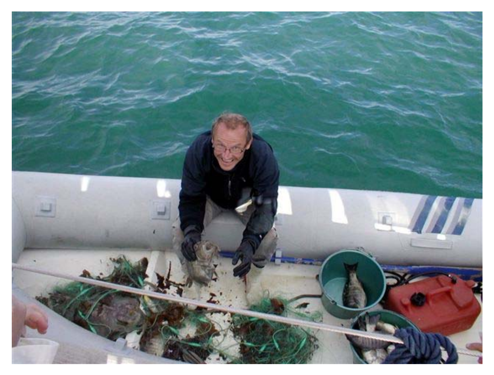
It was difficult to catch fish on the line after the boat, but with net we got more than enough.