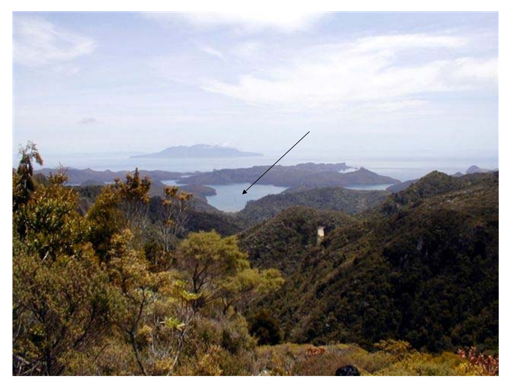
View from the summit of Mount Hobson on Great Barrier Island. Roselina down in the Bay.